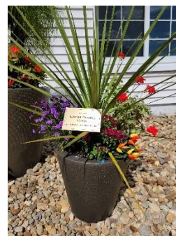
Fall flowers in the Container Garden

The Bow Community Building Container Garden Project continues to thrive! During the first week of September Club Volunteers, Erika Flewelling, Lisa Richards, Sue Smith, Debra Wayne, and Patricia MacNeil, met to swap out some of the Container Garden's summer plants for fall varieties. This included purple and pink aster, golden, red, and white mums, ornamental peppers, purple fountain grass... and a few cabbages.