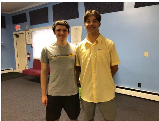
Our Scholarship Recipients

We awarded our two Scholarship winners their checks at our August meeting - two very qualified young men who stayed for our entire meeting.