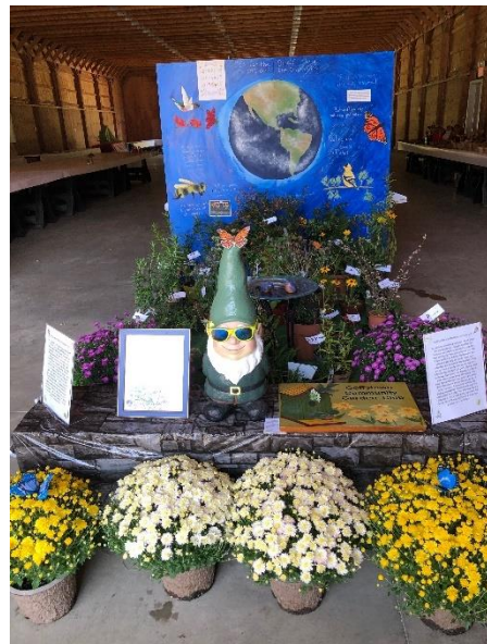
Our display at the fair

Our September meeting was our display at the Hillsborough County Fair. Our display highlighted the use of Native Plantings and Pollinators in our gardens to benefit the Birds, Bees, and Butterflies. We received a Red Ribbon.