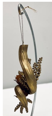
Botanical Arts Hanging Design