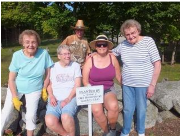
Members Taking a much-needed break after weeding and cleaning near the stone wall in Swanzey, NH on a VERY HOT day.

Another group of volunteers pitched in and did some late summer work in the areas where we maintain public plantings.