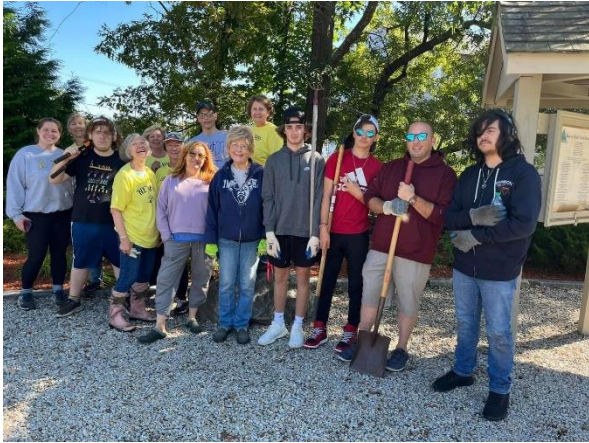
DGC Members and Next Charter School posing for a photo after tackling weeds and bittersweet

At the final Derry Homegrown Farm and Artisan Market, members gave away seed packets from seeds harvested from member's gardens.