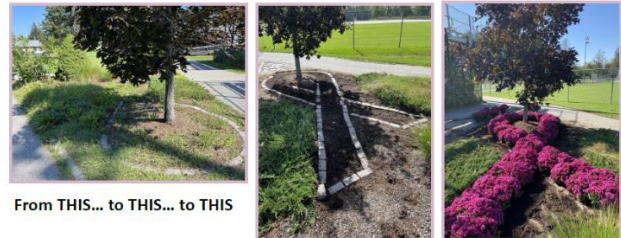
Garden of Hope

Concord on Sunday, October 15 th – another year and another spectacular Garden of Hope.