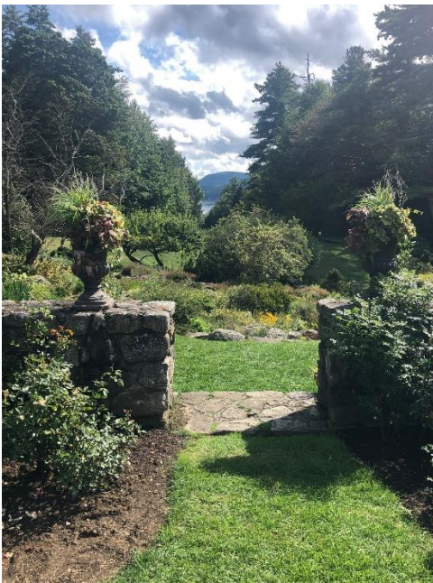
Janet - Garden Scene

We're getting ready for the Club's Photography Show and Contest scheduled in October. There are a number of categories and many members have submitted entries. The photos will be set up in a PowerPoint program for viewing at our meeting. The best photos in each category and the best in show will be selected. We have a talented group of photographers!