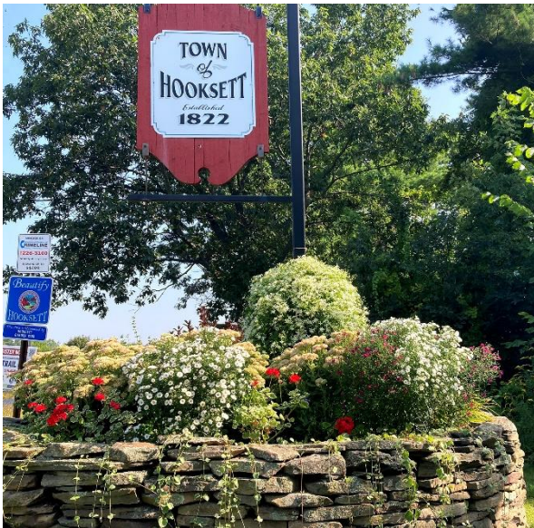
A beautiful fall display at Exit 9 in Hooksett, one of the HGC's many beautification sites.

Although our club meetings are over, we will still be putting the library gardens to bed, holding our wreath pick up day the weekend of Thanksgiving, ringing bells for the Salvation Army, and perhaps having a holiday party before our few months of winter break.