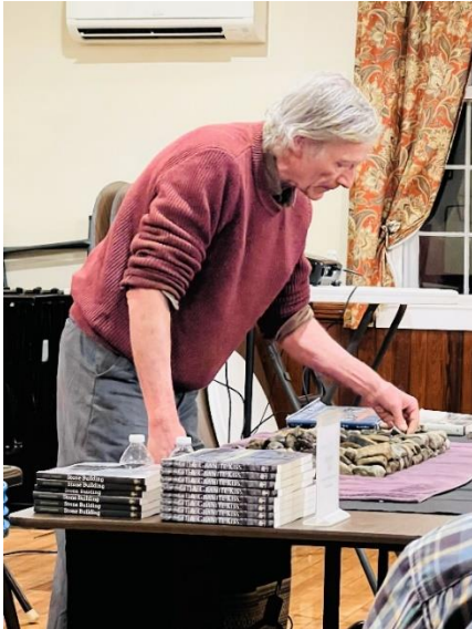
Discovering NE Stone Walls

The month of October begins the club's major fundraiser with the pre-ordering of Poinsettias for delivery in December. We ask members to secure poinsettia pre orders from businesses, families and friends and the public. Orders are available for pickup during our festive Greens Workshop at Bow Community Building on Saturday, December 2 nd . Orders can be placed by visiting www.bowgardenclub.org and clicking "Our Fundraising Events" from the menu.