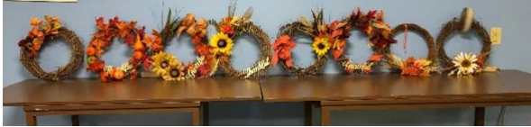
Our lovely variety of Fall wreaths

themed grapevine wreath. The creative juices were flowing. They are all different and lovely.