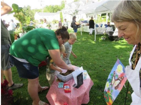
Our Plant and Bake Sale

participate in garden-related activities. We were able to raffle a water garden that was donated to the club.