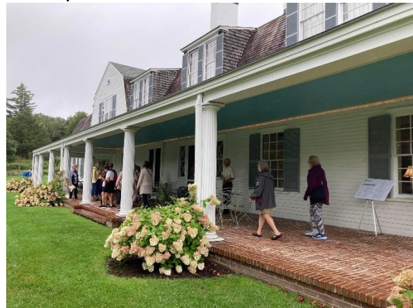
Fun at the Fells!

In September, 19 of our members attended the first NHFGC Fall Event, Fun at the Fells, where we enjoyed private tours of the John Jay estate house and gardens. It was truly a fun day!