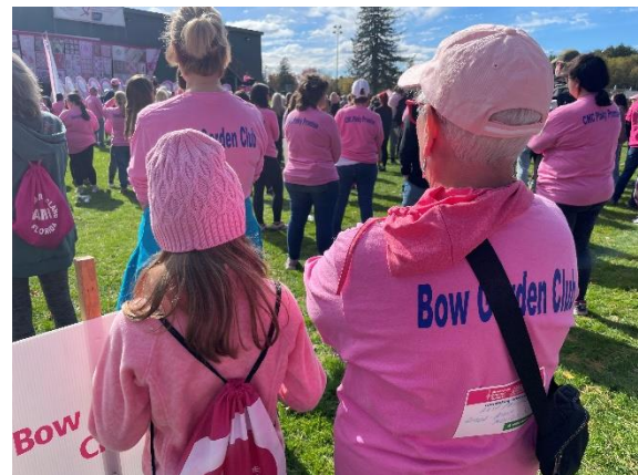
BGC Making Strides Team