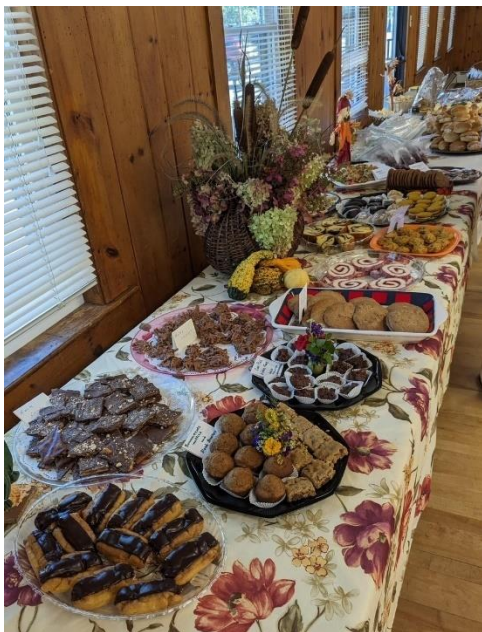
Banquet for our Open Meeting guests!