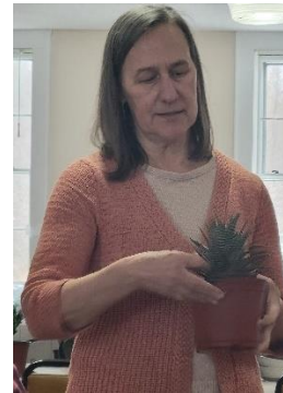
Photo from our previous Succulent Workshop