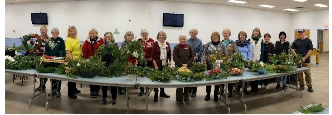
Members display their festive creations from last year's greens workshop

With the close of another year, we are thankful that our membership continues blooming and look forward to those holiday gatherings celebrating our friends, family, and each other.