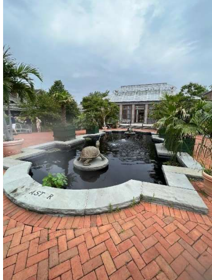
New England Botanical Gardens at Tower Hill