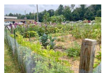
The beautiful blooms at the Greater Derry Boys and Girls Club Children's Garden

Ongoing efforts for civic beautification continue in our public spaces with members signing up for volunteer days. Members also stay busy during growing season with The Boys and Girls Club children's garden by providing garden education and enrichment to the children attending summer camp. The tomatoes look wonderful, and the flowers are simply amazing thanks to the early season rain from Mother Nature.