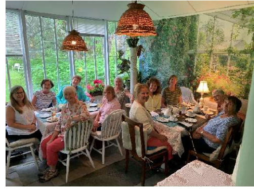
Members enjoyed tea and scones in the Tea House

In late June, members enjoyed visiting Summersweet Gardens at Perennial Pleasures in East Hardwick, Vermont. Summersweet features a nursery and grows more than 900 varieties of flowers, herbs, and shrubs. Visitors can stroll through beautiful gardens, visit the gift shop, and enjoy tea and scones in the garden, and of course purchase plants in the nursery. We had a wonderful time, lunch was delicious, and everyone went home with several new plants.