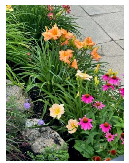
Colorful combination of Daylilies and Echinacea