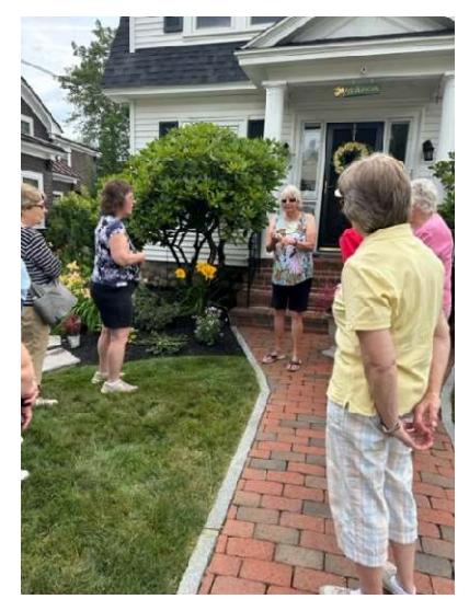
Members enjoying Fiona's Garden