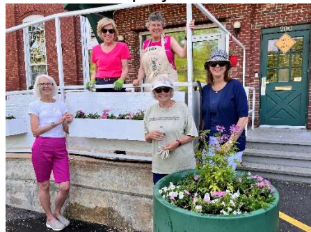
Manchester Garden Club members filling planters at Girls at Work with colorful annuals to greet the girls at work

Over the summer months, planters were filled at the Granite YMCA adding beauty to the front of the building. Annuals were planted at the Gale Home, The Manchester Historic Society and in the planters at Girls at Work. Thank you to the Beautification Committee and MGC volunteers who assisted with these projects.