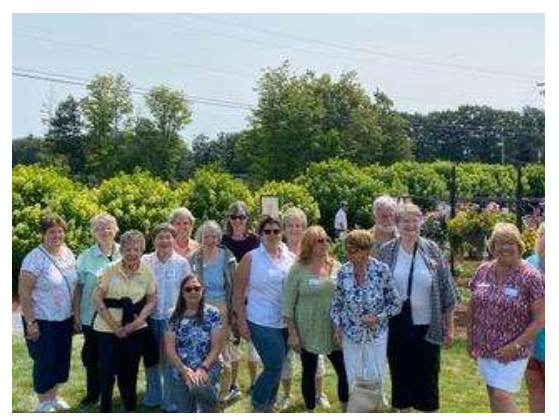
Members at Pleasant View Gardens in Loudon

We held our July meeting at Prescott Park in Portsmouth. In August, we traveled to the Pleasant View Gardens in Loudon to see the show-stopping beauty of their Proven Winner varieties.