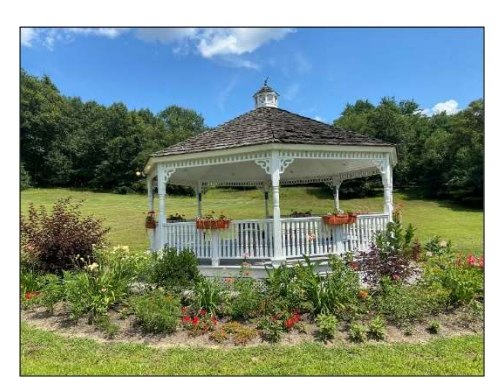
Bow Gazebo Garden

Civic Beautification Committee. A pair of sisters joined our club recently and brought with them a wealth of knowledge and energy. The Civic Beautification Committee, as a whole, designed a summer-to-frost planting scheme for both gardens using native plants, late-blooming annuals, perennials, shrubs and ornamental grasses. More than 120 plants have been purchased or donated for each garden. One of the sisters has donated a myriad of plants from her own garden—many unusual, rarely seen natives and heirloom plants as well old-fashioned cottage garden plants and rare cannas.