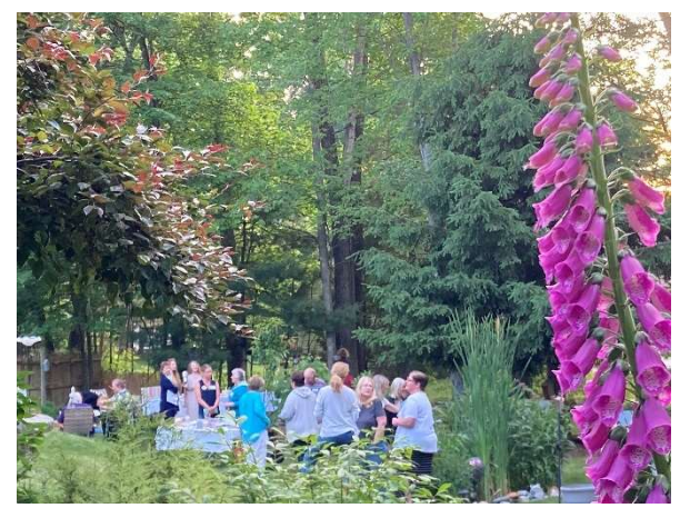
The first HGC garden party of 2023 held at the home of Karen Medeiros

party but her first one was in August of 2021, so we were able to see a completely different garden in June. Karen's gardens include flowers, vegetables, fruit trees and interesting garden art.