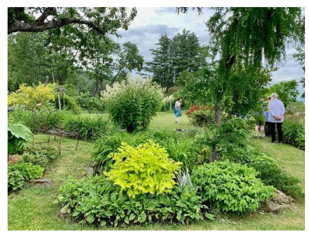
Landaff gardens were unique and beautiful

In July, club members carpooled into the rural area of Landaff, New Hampshire which feels like you're entering a beautiful foreign country. We had a wonderful time visiting unique gardens at three different homes. The day was like a private garden tour!