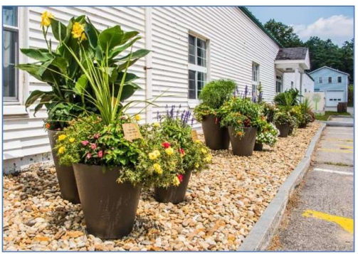
Container Garden Project

The Container Garden Project is thriving. Completed on Memorial Weekend the 17 container plants are glorious and thriving in the summer sun (and rain). Each container was purchased with the help of a sponsor and the outdoor engraved plates for sponsors were added to each container in July.