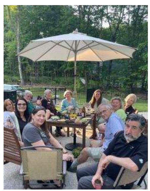
Members enjoying a poolside gathering

Members have been gathering socially in each other's gardens and have been taking trips across the state to experience all the beauty around us.