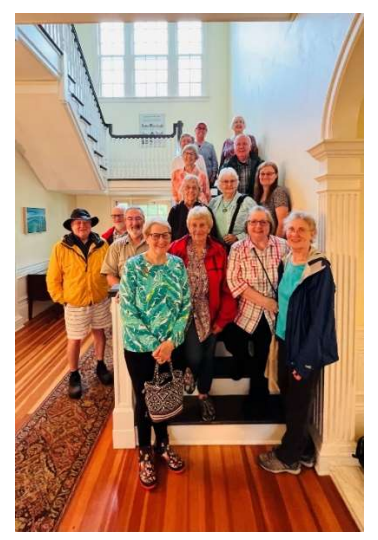
Our happy group at The Fells

Alas the weather did not cooperate resulting in a few last-minute cancellations; however, 15 members and their families braved the torrential rain for a private tour of the historical house and an educational presentation by the Head Gardener followed by a BYO lunch on the verandah overlooking the estate.