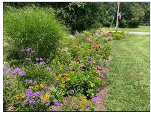
Bow Rotary Park Garden

Garden maintenance runs from July to mid-October and leading up to the first required