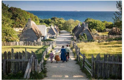
Plimoth Patuxet Plantation

This location affords a great opportunity to explore the historic Plymouth area and enjoy the shops and restaurants in Plymouth Harbor in the autumn. I hope to see you there!