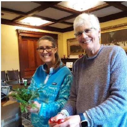
Members made 110 mini-evergreen arrangements that were donated to a senior living home.

A group of members made 110 mini-evergreen arrangements (tiny cat food cans with chicken wire “frogs” held the greens). The arrangements were delivered to a senior living home, so every resident had some greenery in their room.