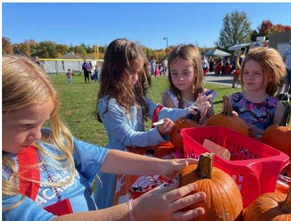
Kids decorating their pumpkins

On the same day, a group of members also cleaned up our butterfly garden at the Nesmith Library.