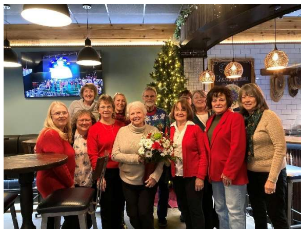
Members attending the HGC Christmas party at the Tap House Grille in December