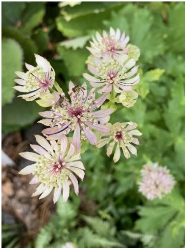
Examples of photos submitted for the Best Flower category.

The LGC Photography Show was held in October. Members were invited to submit photos in five categories. The photos were presented on a large TV screen monitor to the oohhs and aahhs of attendees. Best Photo was selected in each category. Several photos were selected and greeting cards were published and offered to members at a nominal price.