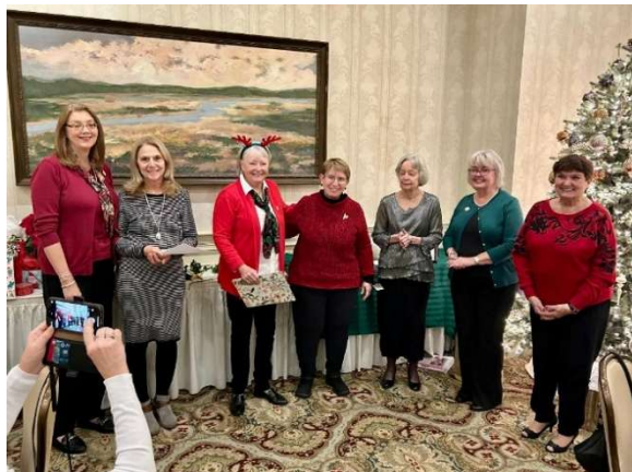
Our outgoing officers pictured at our Annual Meeting and Holiday Luncheon