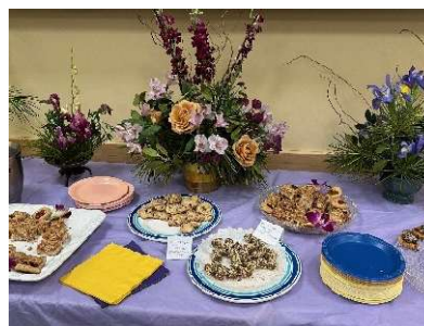
Figure 1 Dessert table featuring striking arrangements by Atkinson Garden Club members, created at our Design Workshop the previous day.