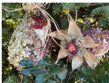
Close-ups of beautiful Decorations on Town Common Tree