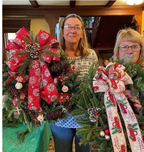
Members display the wreaths they decorated.

In November, members enjoyed decorating wreaths, and everyone went home with a beautiful creation for their front door.