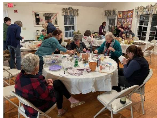
Members busy crafting