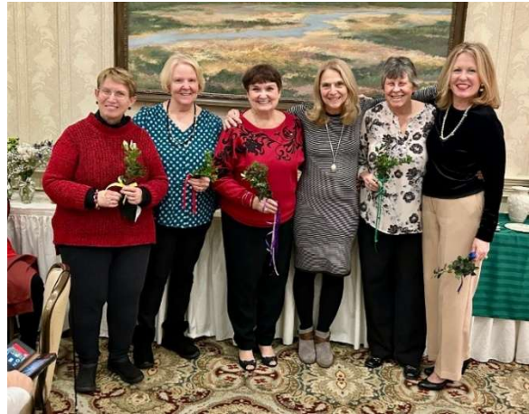
Our 2025-2026 Incoming Officers

Also in December, in keeping with tradition, members set up beautiful holiday decorations at the New Horizons Soup Kitchen.