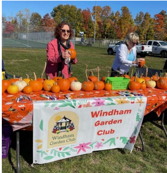
WGC Pumpkin Table

colors were quite stunning! And several others just enjoyed the good food and conversation!