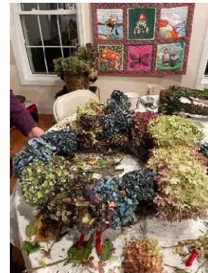
Hydrangea wreath 2

Our November meeting was a craft-oriented meeting as well as our holiday gathering celebration. Some members focused on making acorn and milk weed pod decorations for our Holiday Tree on the town common. A few others tried their hand at dried hydrangea wreaths. The variety and