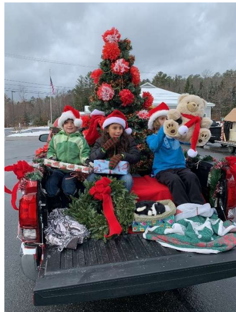
Our float in the Littleton Santa Claus parade was a big hit.

The Club participated in the Littleton Santa Claus Parade. We staged a Christmas tree, kids and presents in the back of a bright red pickup truck and blared holiday music from a boom box. It was a big hit.